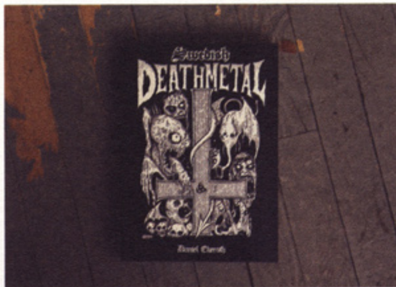
A Bazillion Points publication.

It was a rebellion. I'd been through the big book publishing process twice myself as an author with [the 2004 heavy metal history] Sound of the Beast and then with my Van Halen book. I had a background in DIY music, so the big publishers were so frustrating to deal with. Five years after