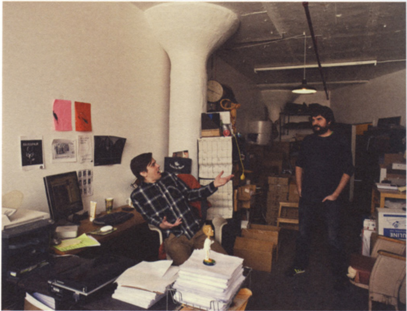
At the Bazillion Points office.