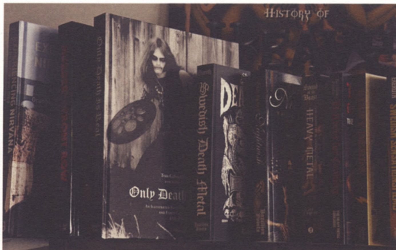
The bookshelf at Bazillion Points.

When I was younger, I would get anything on Touch and Go or Dischord. I trusted the labels and their vision. Sub Pop was like that for a time. Is this something you aspire to with the press?